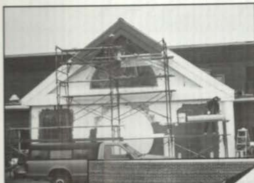
Before and after shots of Lancer Gymnasium completed just in time for this year's commencement activities.

These renovations will greatly enhance the Lancer Gymnasium.