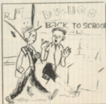
"Don't Look, It's Too Horrible."

The Lakeside appreciates receiving your letters to the editor. Sign your name and address. Your name will not be used, if you so request. We welcome letters that agree or disagree with our editorial views.